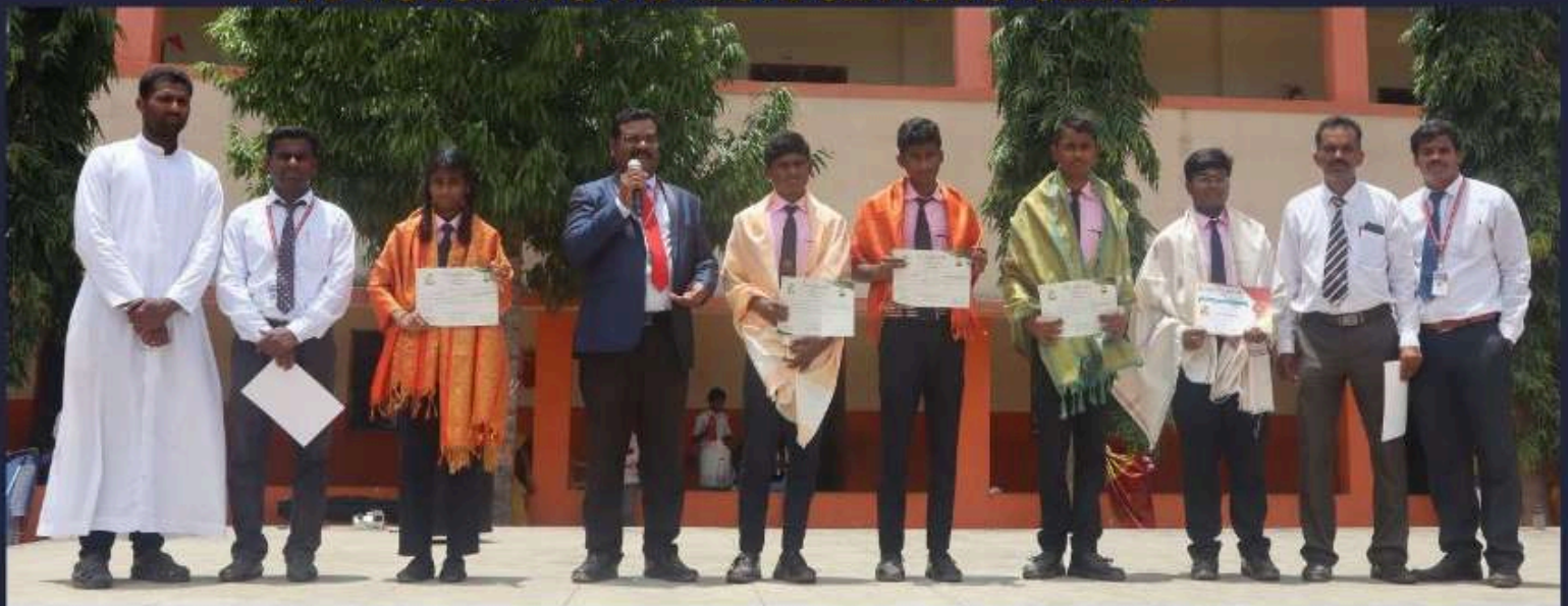
WE HAVE CONDUCTED GAMES FOR THE TEACHERS